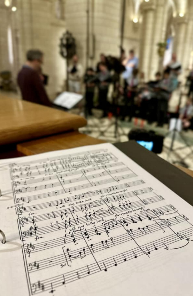
The original manuscript of the Exodus Canticle written for the Cathedral by Andrew Reid