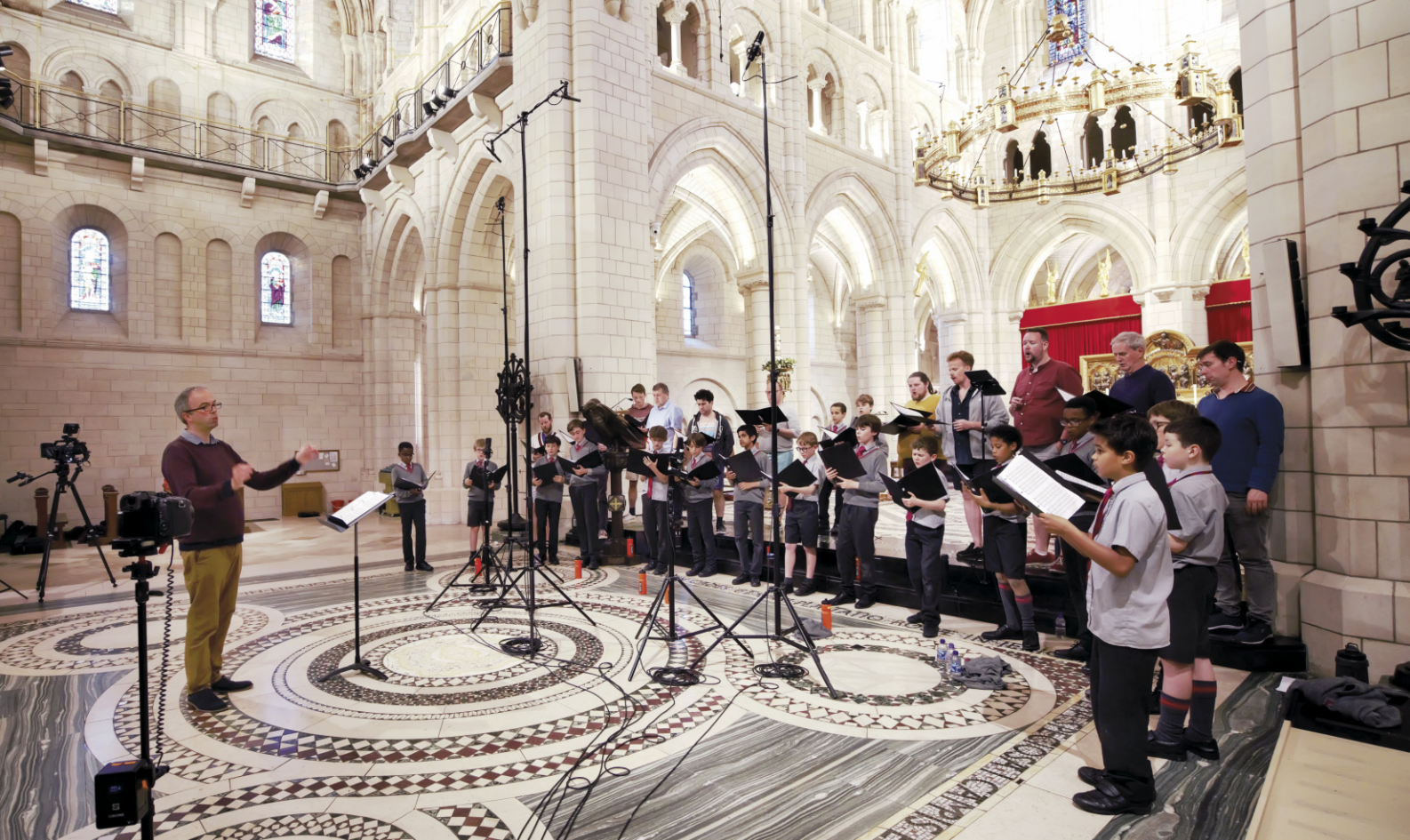
The Choir of Westminster Cathedral during a recording session at Buckfast Abbey