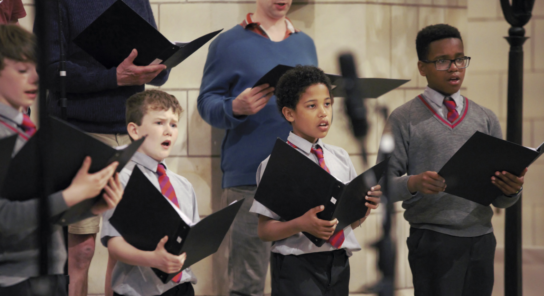
The Choir of Westminster Cathedral during a recording session at Buckfast Abbey