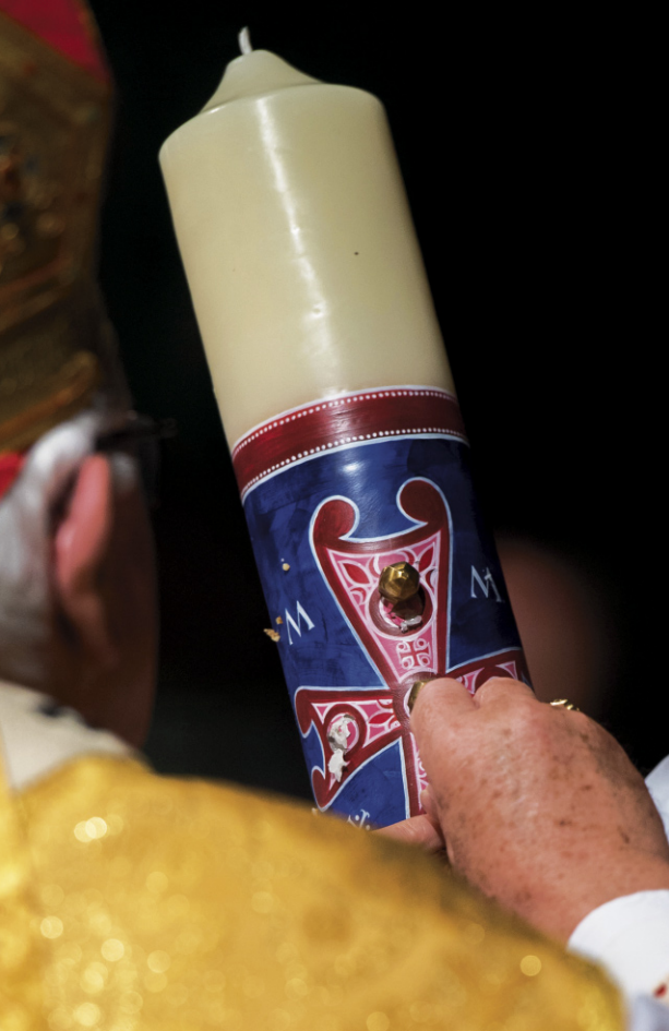
Cardinal Vincent Nichols inserts the grains of incense into the paschal candle