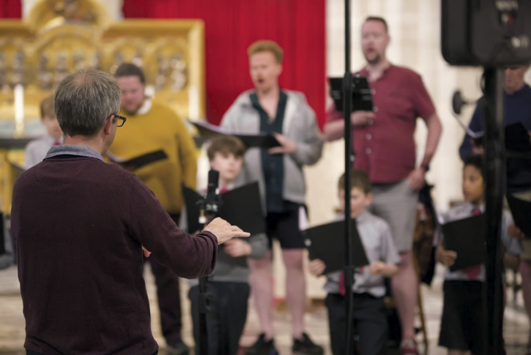
The Choir of Westminster Cathedral during a recording session at Buckfast Abbey