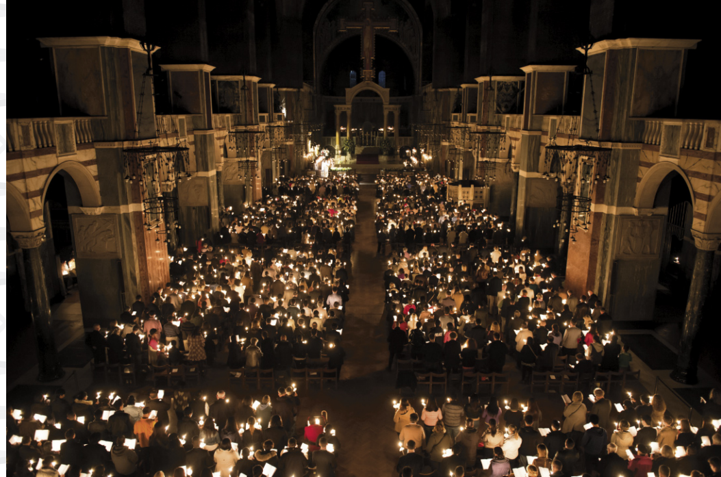
A great wave of light spreads out across the Cathedral's nave until the building is filled with the warm glow of candlelight

afternoon; the deacon or priest bearing the candle sings Lumen Christi , and the people respond Deo gratias . The procession makes its way slowly forward through the still-dark nave. Once the candle has reached the very centre of the building, the sung dialogue is repeated again at a higher pitch. There then follows one of the most spectacular moments of the liturgical year. Each member of the vast congregation carries a candle. Those nearest the centre have their candles lit from the paschal candle, and then pass the light to their neighbours. A great wave of light spreads out across the Cathedral's nave until the building is filled with the warm glow of candlelight. Darkness turns to light; a new and everlasting day dawns; Christ, who is the True Light, enters our broken world. The Cathedral's soot-blackened domes overhead appear to contain shadows and shapes from the gently flickering light, as the procession continues its way to the sanctuary. There, Lumen Christi is sung for a third time, at an even higher pitch than before. (This joyful ascent finds a beautiful parallel later in the service.) Finally, the deacon or